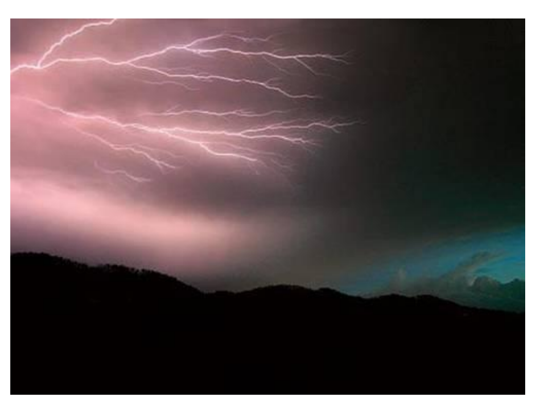
"So, forgive me, Lord, but it would take at least 10 years for me to finish this Ark."