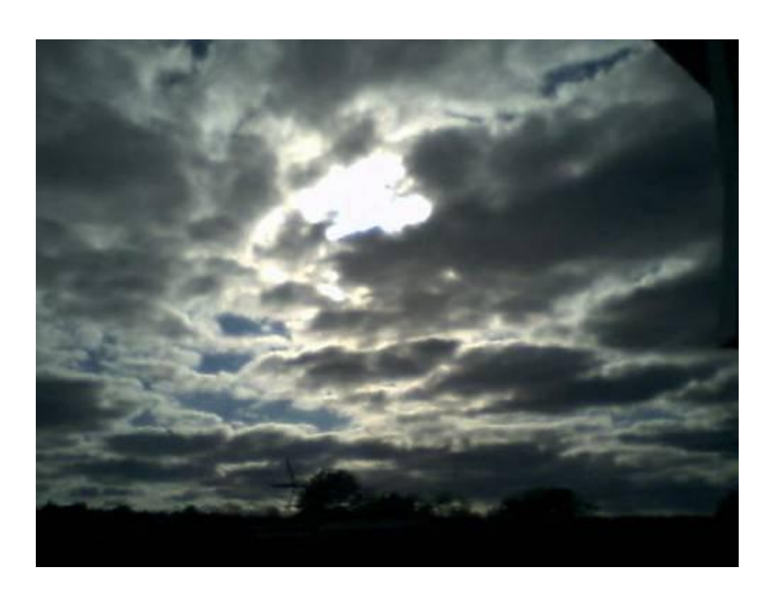
"No," said the Lord. "The GOVERNMENT beat me to it."