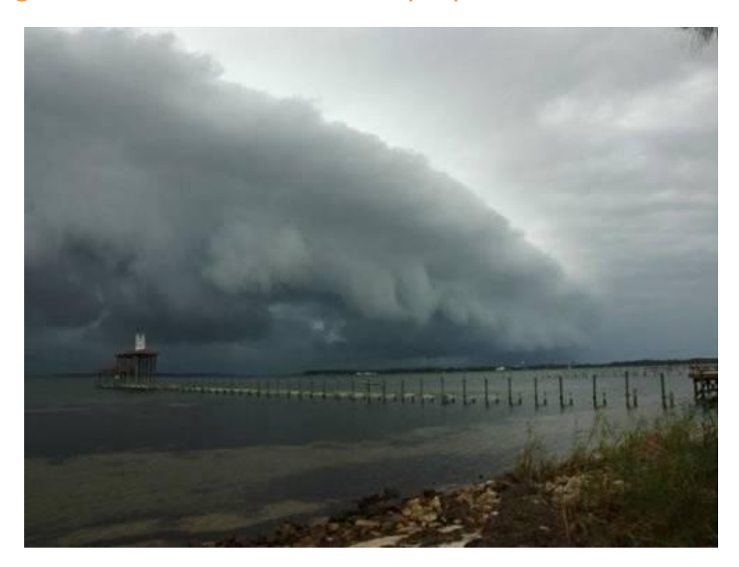
"The trades unions say I can't use my sons. They insist I have to hire only Union workers with Ark-building experience."

"Immigration and Naturalization are checking the green-card status of most of the people who want to work."