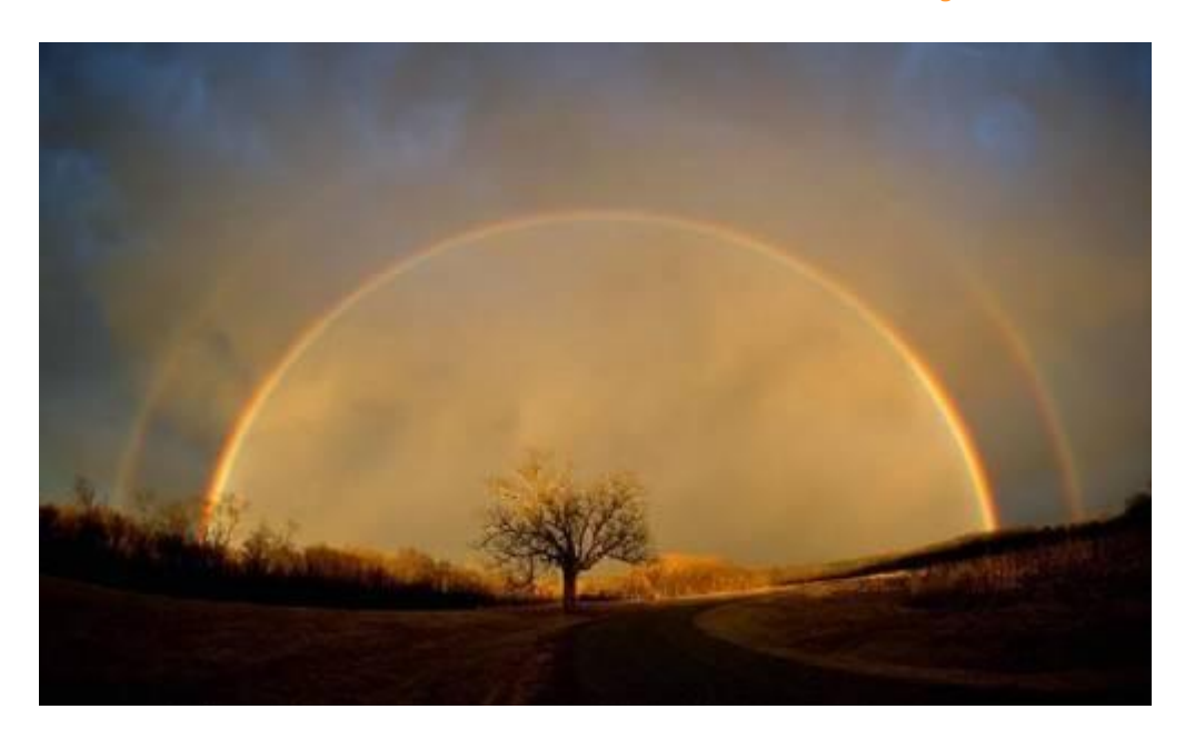
Noah looked up in wonder and asked, "You mean you're not going to destroy the world?"