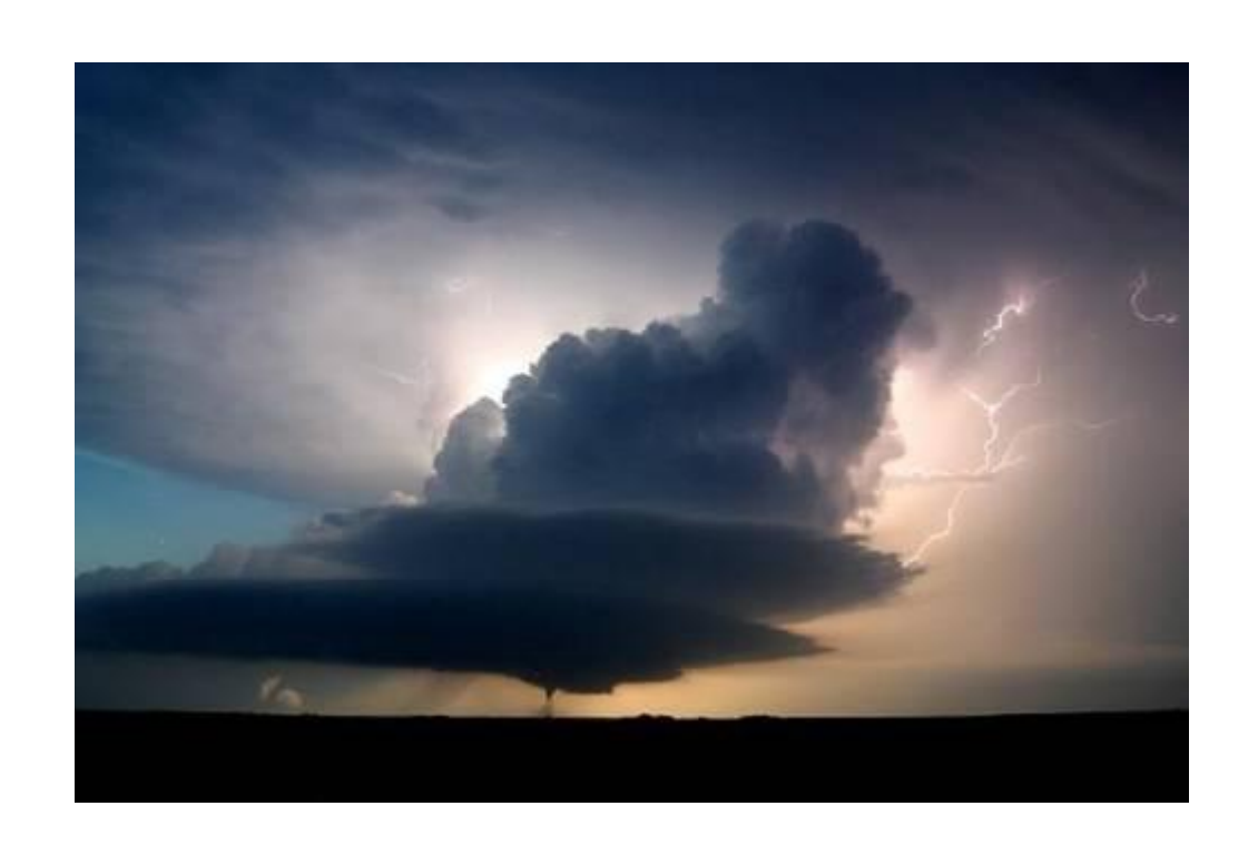
"I needed a building permit."